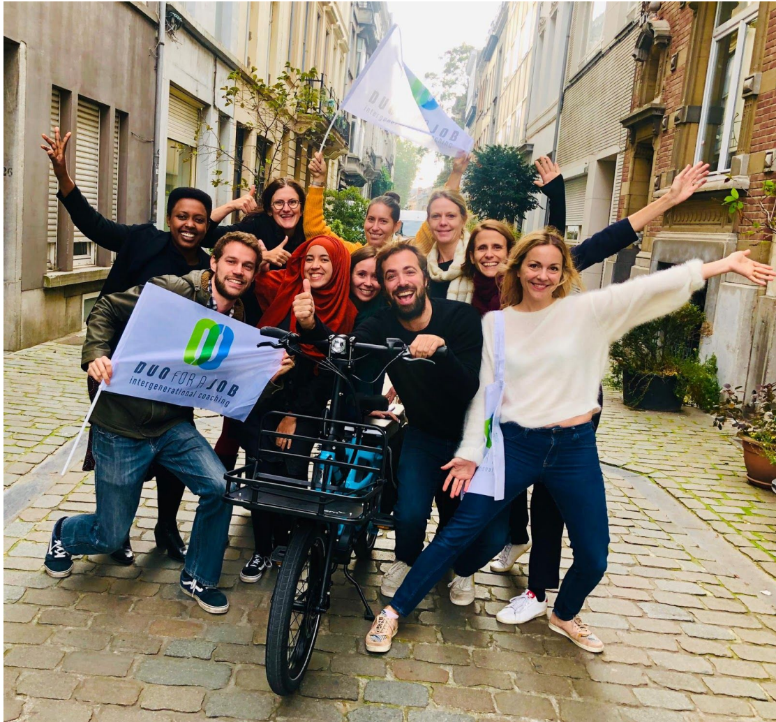
The DUO for a JOB team poses with their Tern GSD. They use the cargo e-bike to transport materials to job fairs and other events.

DUO for a JOB (Belgium) matches young job seekers with an immigrant/refugee background with senior professionals who have experience in related fields and who can accompany and support them in their job search. The organization is using the GSD to transport materials to job fairs and other career-related events in inner-city locations that are often difficult to access by car.