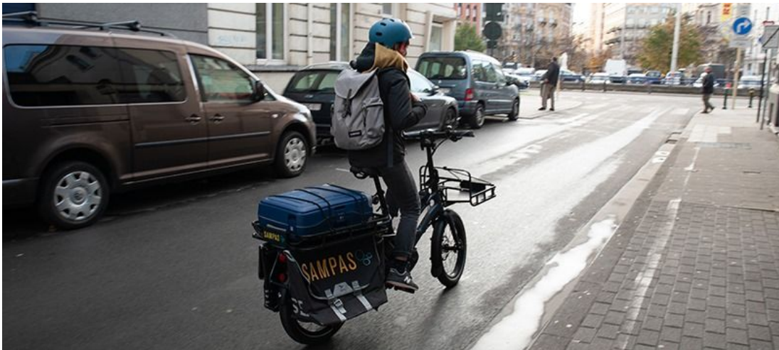
A SAMPAS team member carries a FibroScan diagnostic testing device to a medical screening station in Brussels using a Tern GSD.

SAMPAS, a Réseau Hépatite C Initiative (Belgium) is a team of mobile medical and social workers offering treatment to current or former drug users infected by the hepatitis C virus. They use the GSD to transport diagnostic equipment and even a portable tent for medical screening sessions. The SAMPAS team says they choose cycling as a mode of transport whenever possible for its convenience and environmental friendliness.