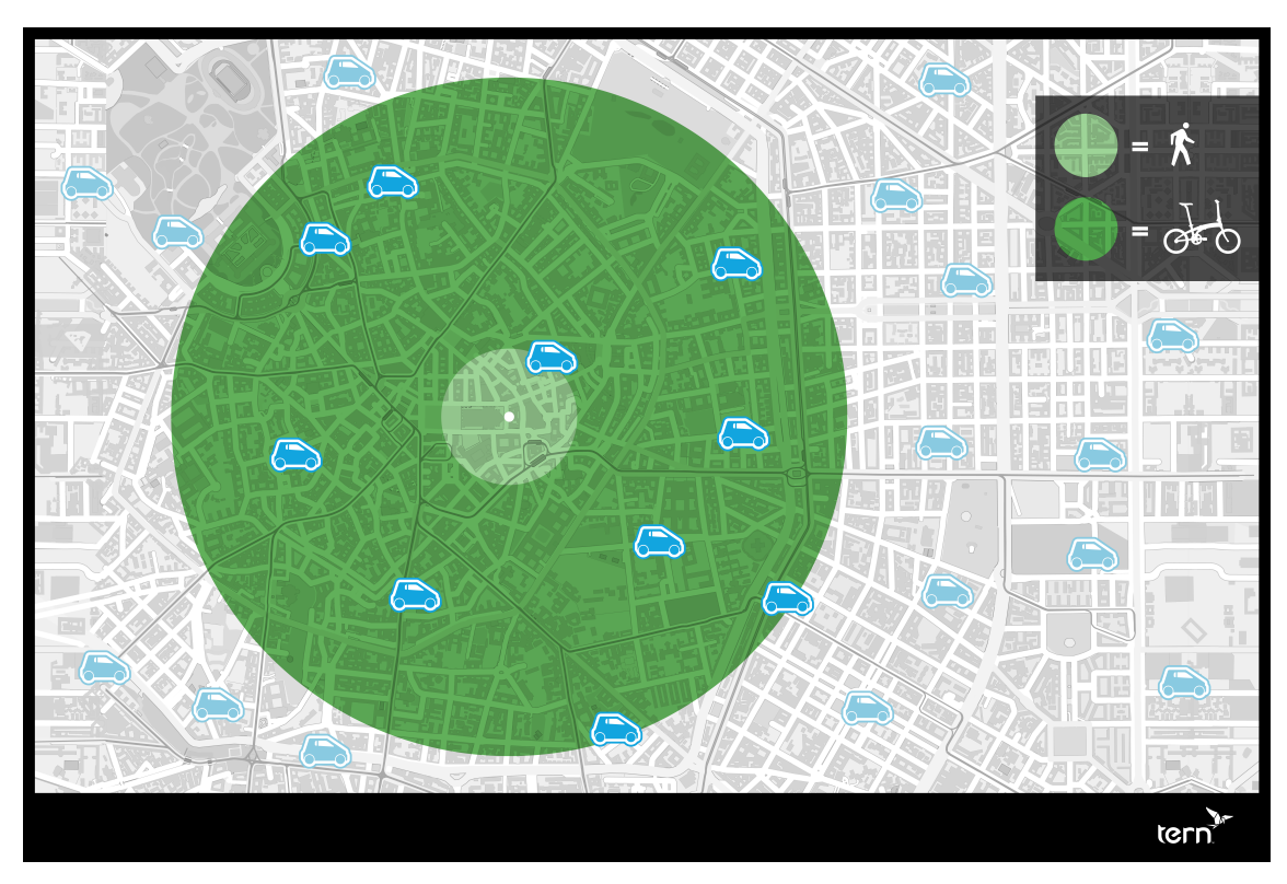
Riding a bike gives car share users access to a wider pool of cars.